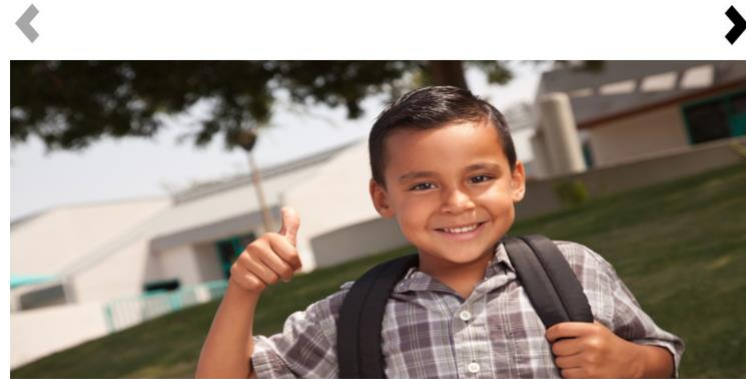
Deciding to Follow Rules for Taking Medicine Safely