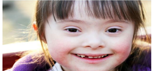
Making Decisions to Have Fun With My Oral Health